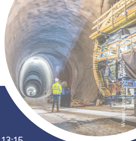
Wiener Linien / Simon Wehner

The excursion provides insights into one of the city's most significant public transport expansion projects, focusing on metro development, integration, and pedestrian mobility. Using the construction site at Pilgramgasse and the area near TU Wien as case studies, participants will explore ongoing works and key planning principles of the U2 x U5 project, including accessibility and passenger flow. In addition, the excursion introduces a hybrid, data-driven planning approach by the City Intelligence Lab, showing how citizen input can be translated into real-time 3D models to assess impacts on urban space and mobility.